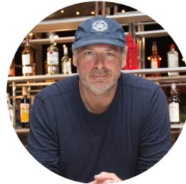
KEN LYON Charcoal Garden Bar & Grill